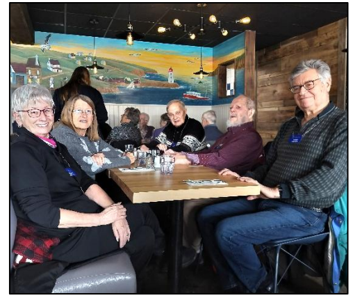
More photos from our January lunch out at the Merivale Fish Market