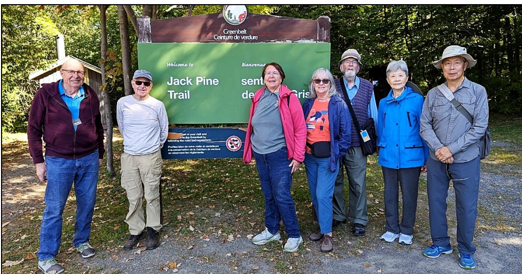
NCC Trail Walk. These are some of the members who enjoyed a leisurely walk on the Jack Pine Trail and boardwalks in September.