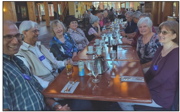
The Ironside Grill at the Marshes Golf Club was the venue for an enjoyable meal and get-together at our September lunch out.