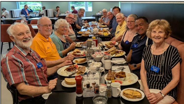
The Breakfast Club has been having regular monthly meetings, even over the summer. This was our June meeting at Allô mon Coco.

Check out our book swap table at every meeting