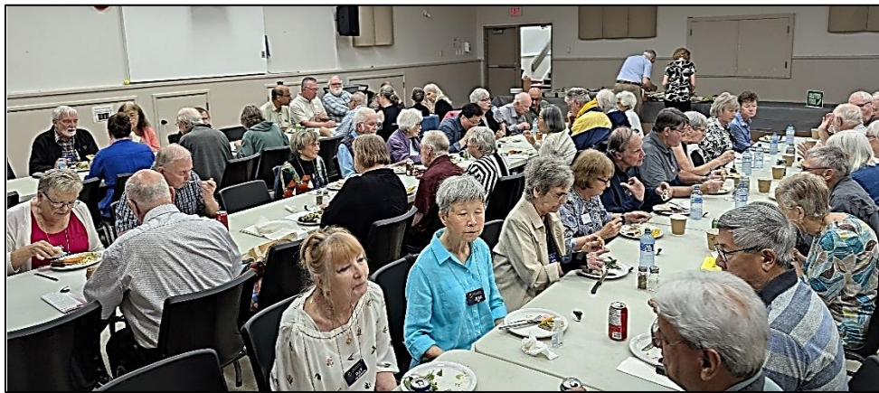
The End of Year Luncheon following our June meeting featured an extensive buffet selection and was well attended.