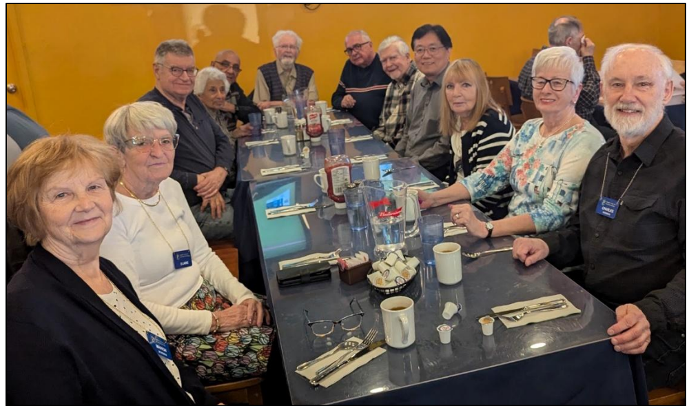
The Probus Breakfast Group met in April for their third outing. This time at Summerhays Grill. If you want to join our outings, please sign up on the Breakfast Club sheet at the May meeting