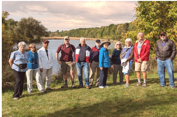
01 October Beaver Pond Walk