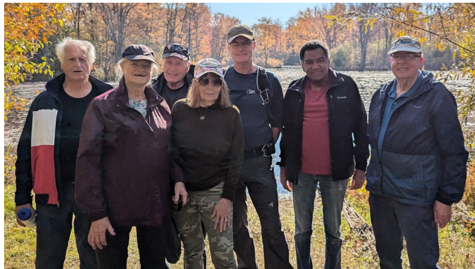
22 October Mud Lake Trail