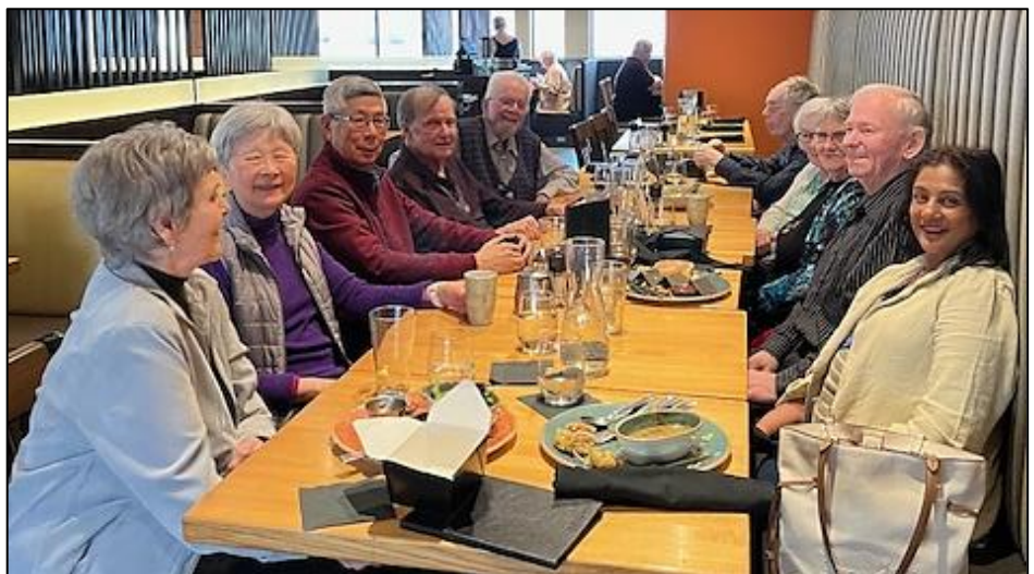
Milestones was the venue for our March lunch-out