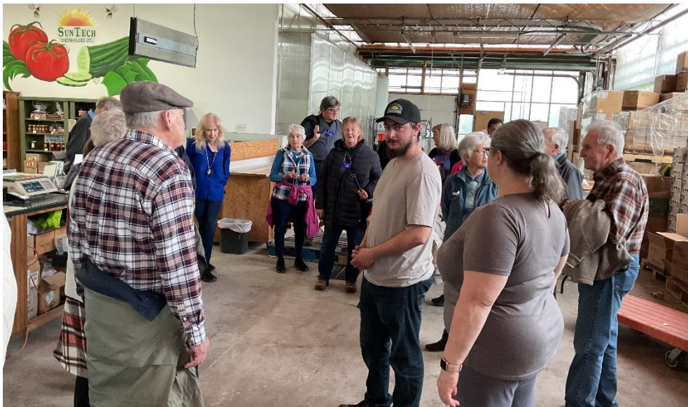
Sun Tech Greenhouses hosted a group of 30 Probud members in March. They found it very informative and appreciated the tour. Due to its popularity a repeat visit will occur in May (see below).