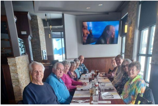
January 25 lunch at Hard Stones Grill (above) followed by Glow in the Dark mini golf at The Putting Edge (below).