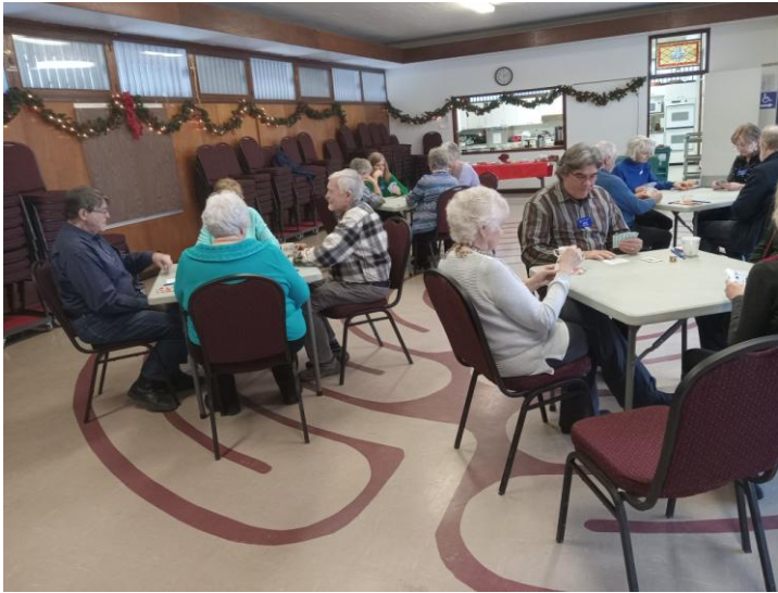
The Euchre Group enjoyed their final game of the year after a Christmas Potluck lunch.