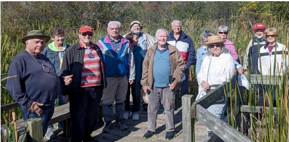
On September 21, fifteen happy trekkers enjoyed a beautiful autumn day, on a leisurely 2.5 km. walk of the NCC Beaver Trail, located just south of Hunt Club Road on Moodie Drive. Plenty of chickadees and a few chipmunks enjoyed the walk with us.