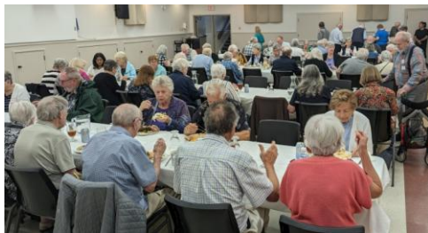
Our in-house June Catered luncheon had 64 attendees. Food was provided by Leatherworks and greatly enjoyed.