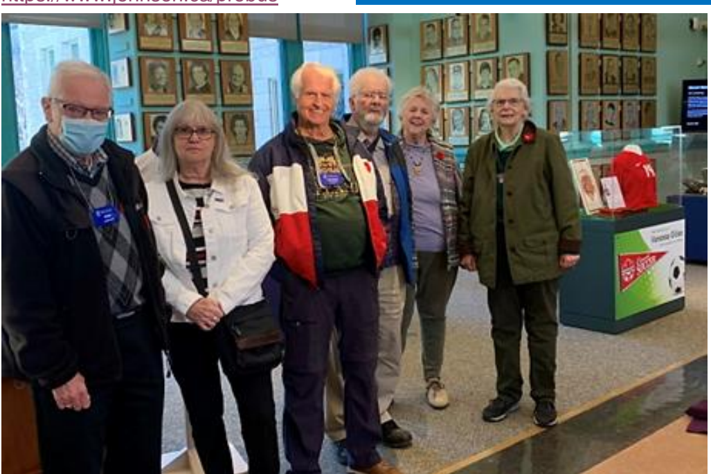
City Hall visit. These are just some of the participants who toured the City Art Gallery and the Ottawa Sports Hall of Fame.