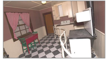
The Crazy Kitchen

Following the museum visit we will have lunch in Robbie's Restaurant. It is located just a few blocks north of the museum at 1531 St. Laurent Blvd. Their specialty is Italian food and we will arrange to meet there at 12:30.