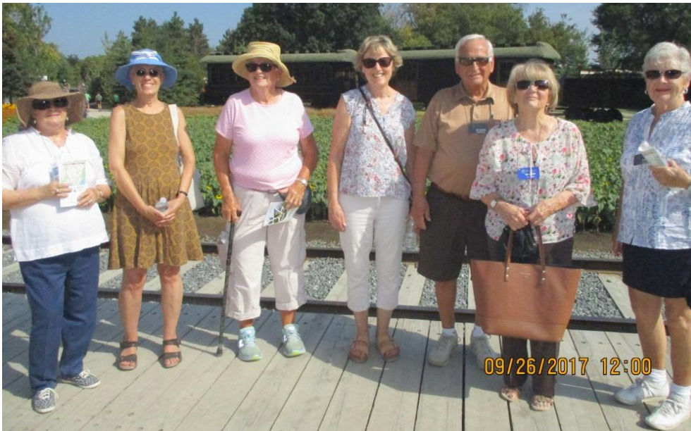
The Mosaicanada 150 visit featured sunny weather and many floral exhibits to see. The tour was punctuated with lunch at the Green Papaya Restaurant.