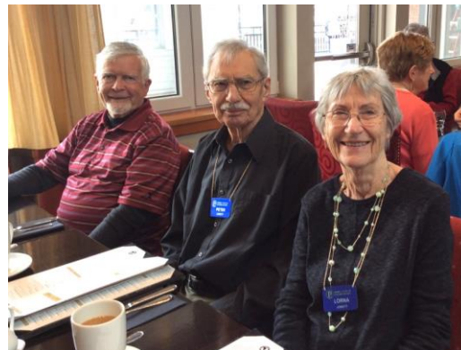
The Black Dog Restaurant proved to be a popular venue for our lunch-out in April with a large number of club members taking part.