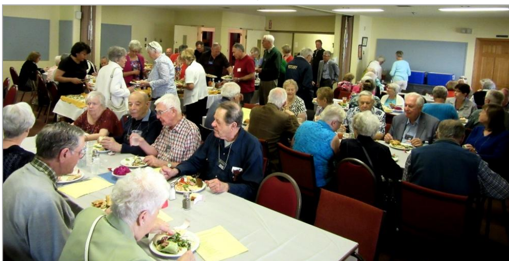
End of year luncheon. We had a good turnout for the June luncheon and the catered light lunch received many complements.

This is also a good time to update your email address and other particulars.