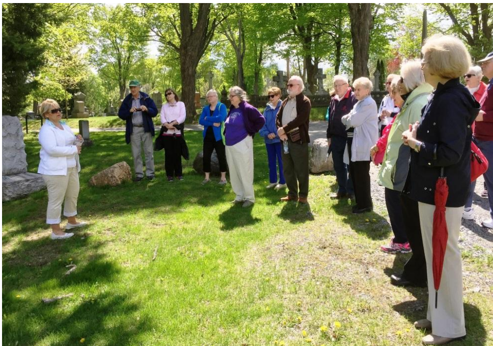
Our guide explained that this is also Canada's National Cemetery.