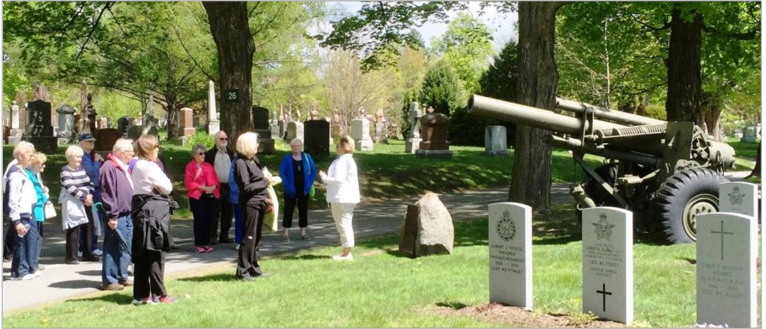
Beechwood Cemetery was the venue for a highly successful tour in May. For more photos visit our website and the "Photos" page.