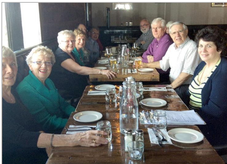
The April restaurant luncheon was at 1951 West (Kitchen and Grill) in Bells Corners.